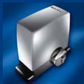
tousek sliding-gate operators compact and safe