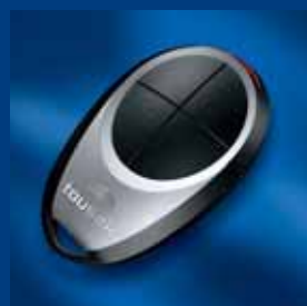
tousek impulse emitter programmes compatible and secure