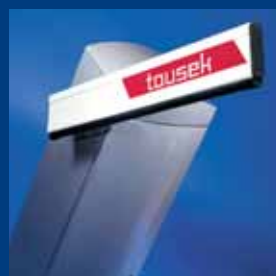
tousek barrier systems attractive and robust