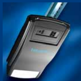
tousek garage doors operators convenient and safe

Your tousek partners will be happy to advise you personally.