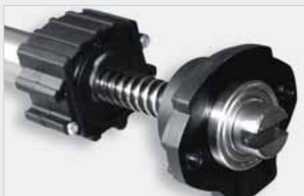
Detail of the solid steel spindle, resting on ball bearings

The components are protected from dust and damp in an anodised aluminium casing.